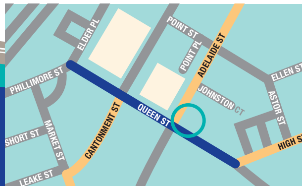
Fremantle: Level 3, 22 Queen Street