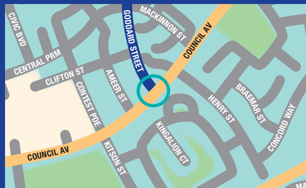
Rockingham: U3, 3 Goddard Street